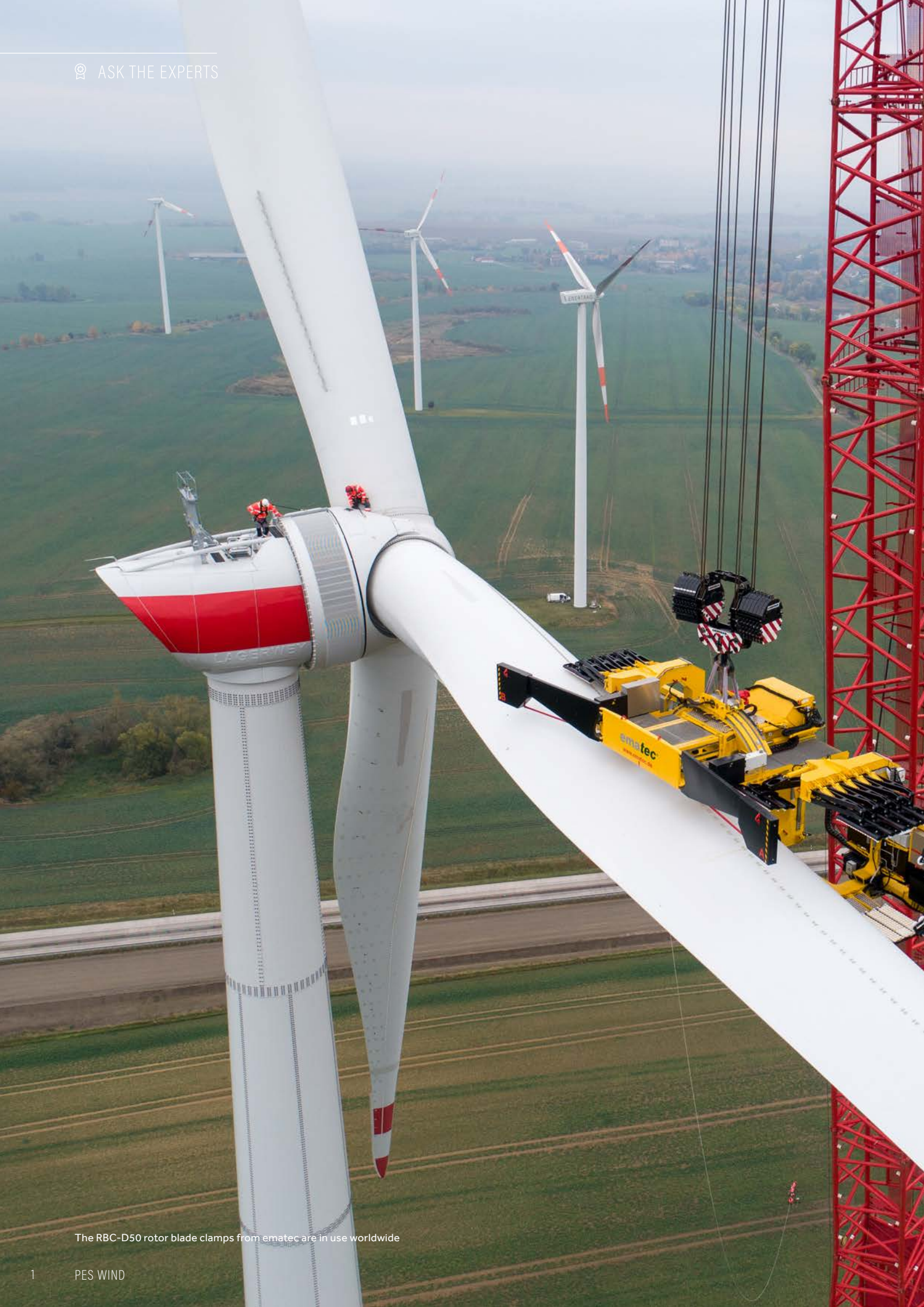
The RBC-D50 rotor blade clamps from ematec are in use worldwide