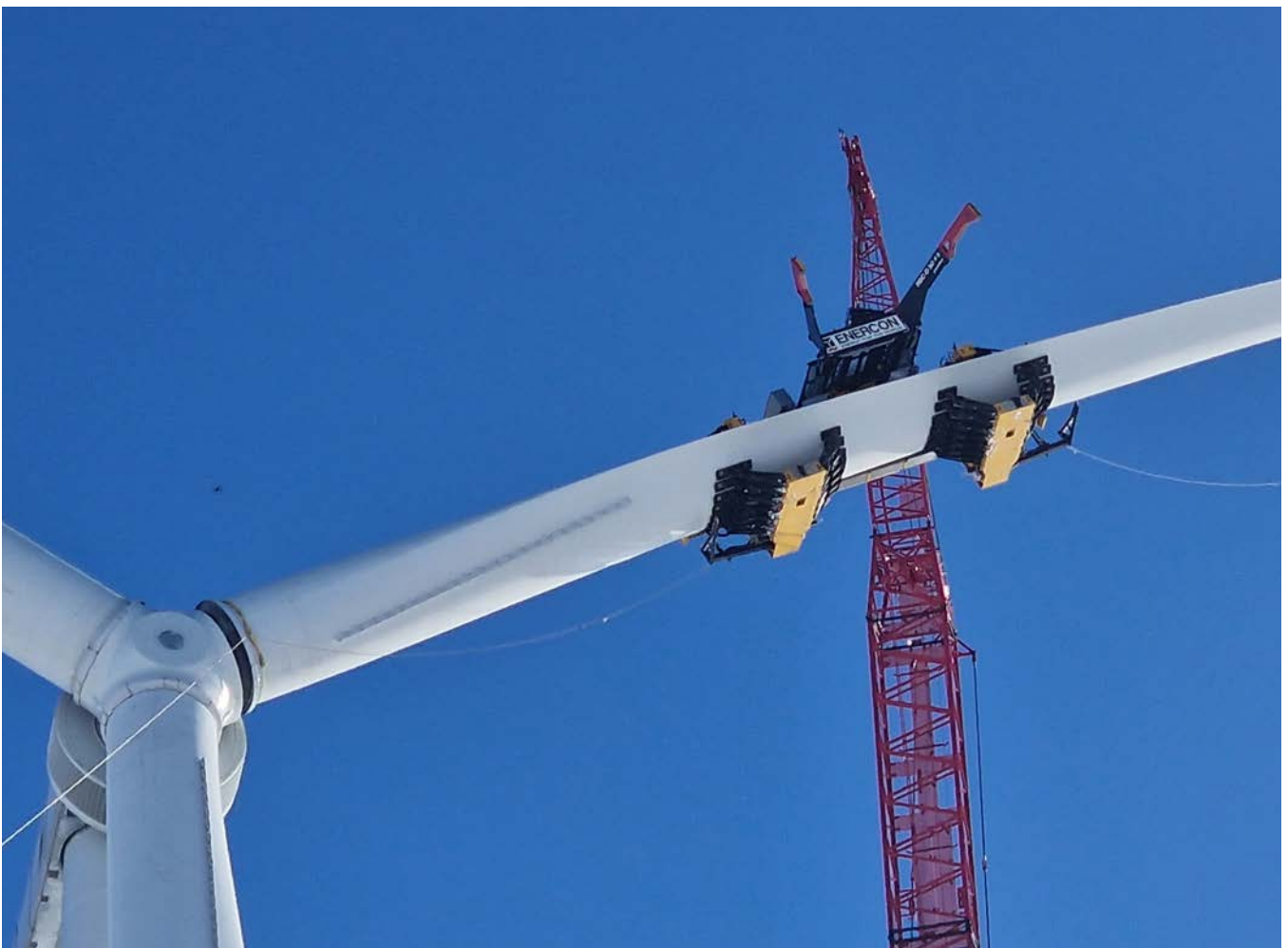
With its RBC-D yokes, ematec has revolutionised the assembly of rotor blades

suppliers, which are often customised for specific blade geometries, our RBC yokes are universal. This means each new wind farm or rotor blade doesn't necessitate a new traverse. Service providers can simply load the RBC or RBC-D onto a trailer and transport it seamlessly from one project to another. It couldn't be more straightforward.